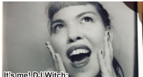
It's me! DJ Witch: Both Amethyst and Nasty Can I read your cards?