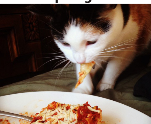
guys, one time my cat ate lasagna off my plate garfield dreams achieved